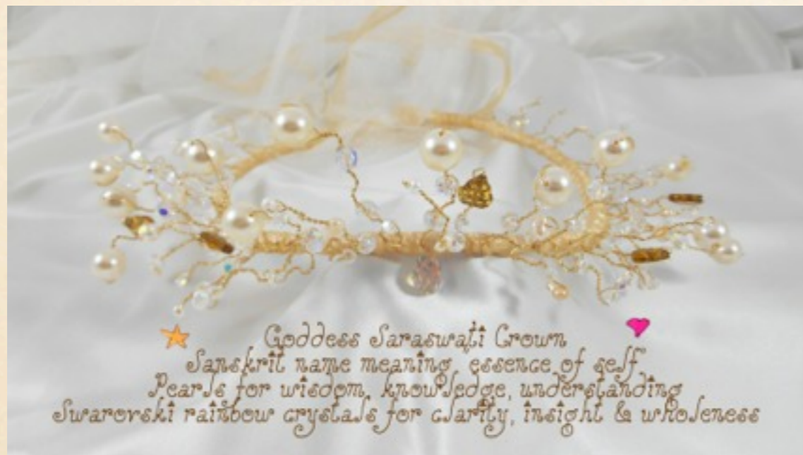
★ Goddess Saraswati Crown ♡ Sanskrit name meaning essence of self Pearls for wisdom, knowledge, understanding Swarovski rainbow crystals for clarity, insight & wholeness