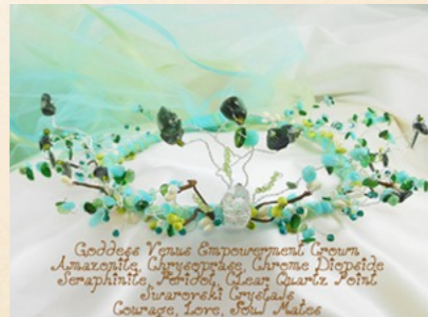
Goddess Venus Empowerment Crown Amazonite, Chrysoprase, Chrome Diopside Seraphinite, Peridot, Clear Quartz Point Swarovski Crystals Courage, Love, Soul Mates